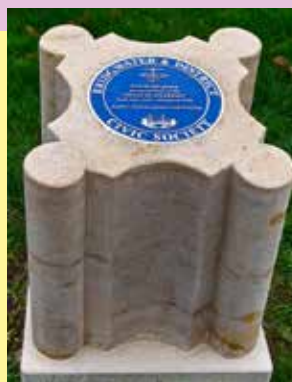
A blue plaque for Bridgwater