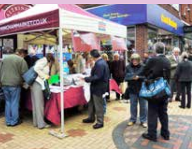
Civic action in Altrincham

This was truly a magnificent effort from members and officers alike, and we are really grateful for your support.