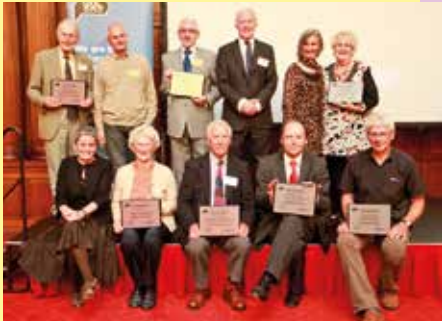
Civic Day award winners in Sheffield