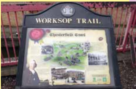
A walk for Worksop