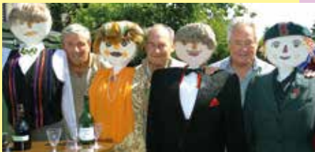
Civic scarecrows (and friends), Blackpool