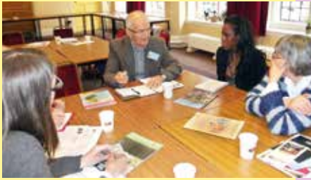
Discussing fundraising in Birmingham