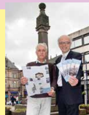
A heritage trail for Huddersfield