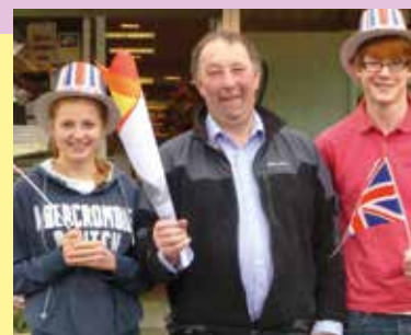
The Hale 'torch' civic day celebration