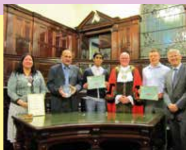
Award-winners in Halifax